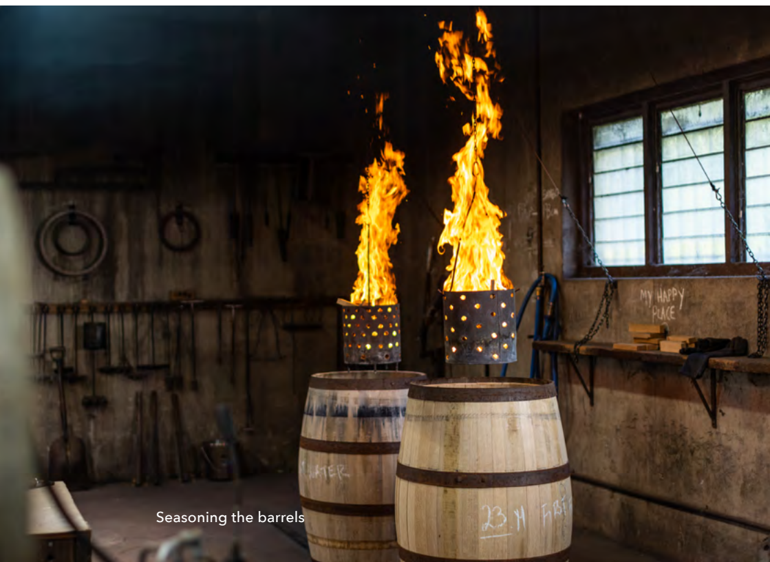
Seasoning the barrels

By 1889, Yalumba was 'still outpacing all other brands in public estimation'. Around 1890, Yalumba established its own barrel-making team and cooperage at the winery. This was in response to the enormous orders of dry red wine from the United Kingdom and the increasing production of fortified wine and brandy. The tradition of running a chateau-style cooperage has been an integral part of Yalumba's identity for over 130 years, and was inspired by the shipping method of the time. Almost all of South Australia's exports were shipped in 300-litre oak hogsheads.